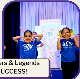
Leaders & Legends SUCCESS!