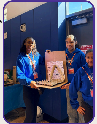
Teen Council at Regionals!