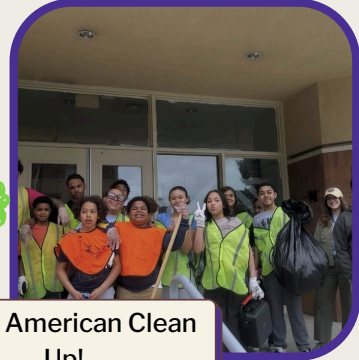
Great American Clean Up!