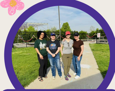
Weidenhammer Creative Team joining us through United Way of Berks County Spring Into Action