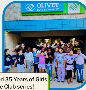
Completed 35 Years of Girls in the Club series!