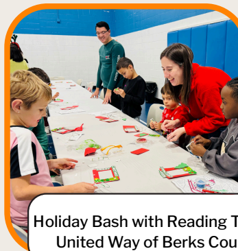
Holiday Bash with Reading Truck & United Way of Berks County!