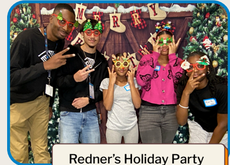
Redner's Holiday Party Photo Booth!