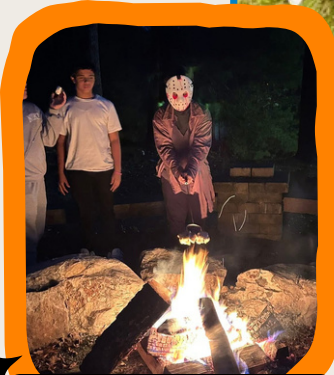
Teen Takeover at BMC