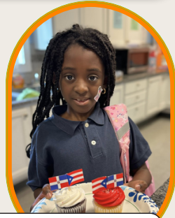
Hispanic Heritage Month