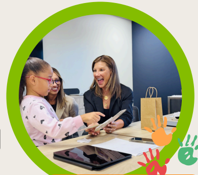
35 Years of Girls in the Clubs